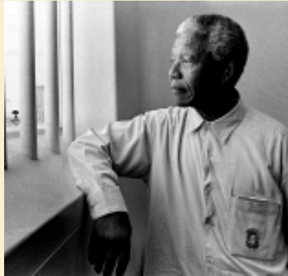
Nelson Mandela revisits prison (1994), where he was incarcerated for more than 25 years.

The exhibit opens with the story of the dramatic transformation of South Africa from the ugly racial violence to “The Rainbow Nation.” From the 1940s to the 1990s, South Africa’s policy of extreme segregation—“Apartheid”—meant cruel mistreatment of all people of color. South Africa seemed ready to destroy itself in a racial civil war.