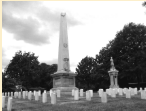
View of the Union Monument (1876) and the Maine Monument (1908) at Salisbury National Cemetery, North Carolina.