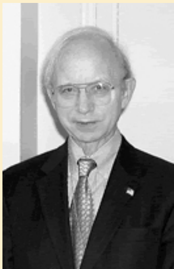
Archivist of the United States, Allen Weinstein

Weinstein delighted the audience with reminiscences and observations—some lighthearted, some more serious—about his career and the archival landscape. He organized his remarks around what he called his “Twelve Step Program” for achieving success in managing federal programs: a series of slightly tongue-in-cheek aphorisms, such as “Prepare for the Law of Surprises,” “Budget for the Unexpected,” “Accept the Things You Can’t Change—Then Change Them Quickly and Quietly,” and “Beware of Metaphors—They Bite.” Illustrating his aphorism about metaphors, Weinstein recalled his rash promise to visit every National Archives and Records