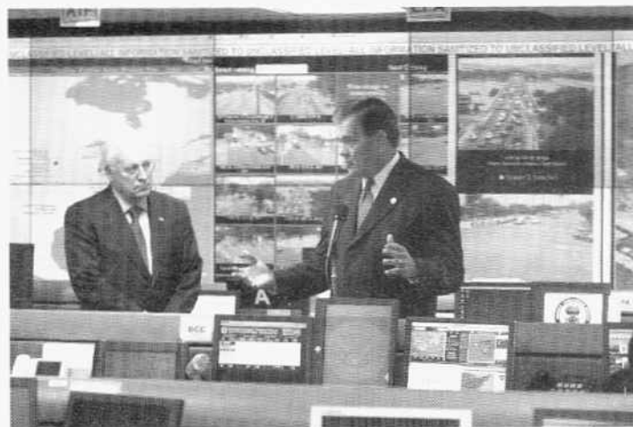
Vice President Richard Cheney (left) and Secretary of Homeland Security Tom Ridge tour the Homeland Security Operations Center.