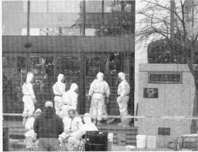
Following delivery of an anthrax-contaminated letter on October 15, 2001, The Hart Office Building was closed for three months.