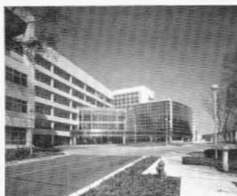
The National Archives Building at College Park, Maryland.

At the same time, a NARA-wide oversight committee was established to develop policy for the program. The committee was made up of representatives of headquarters and regional NARA offices. NARA began to identify boxes that contained potential records of concern so these records would not be taken to the research room before screening. A team was established to begin screening these potential records of concern.