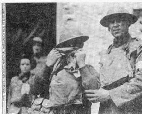
While a fellow doughboy steadies him, a shell-shocked American soldier shields himself from the camera in France, 1918.

in the literary accounts that proliferated during and after the war. The exhibit also traces shell-shock's antecedents and its later manifestations in other twentieth-century wars. The exhibit will be on display through May 31, 2005.