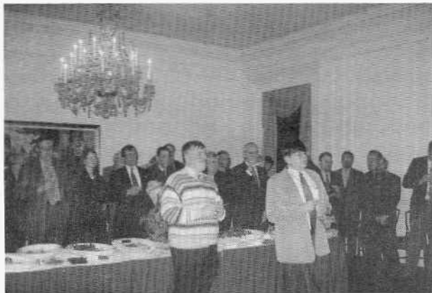
Society members and their guests listen to presentations at the holiday reception.

On January 10, 2004, SHFG joined with the National Council on Public History and the Public History Committee of the American Historical Association to co-sponsor a reception at the annual conference of the American Historical Association in Washington, DC. Approximately 50 people attended the reception, which was held to better acquaint the larger historical community with SHFG and its activities.