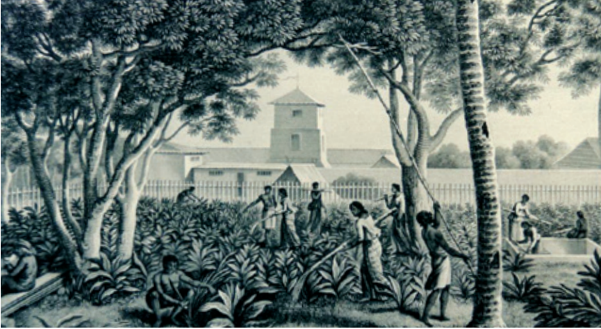
CHamorus laboring in the garden of the Spanish governor's palace, Agaña, from a painting by Louis Choris during the Louis Freycinet expedition, 1817–19.