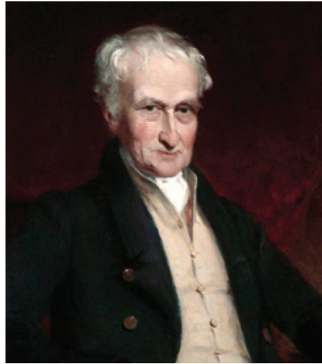
James Maury of Virginia was a long-serving U.S. consul to Liverpool, 1790–1829.

The United States Consular Service was one of the largest and most active divisions of the antebellum federal government, yet it was nearly invisible then and remains so in retrospect. This condition superficially appears to support a traditional exceptionalist understanding of the United States initially rejecting the European model of a larger, more powerful, bureaucratic state. More recently, however, historians of American political development have taken a somewhat less exceptionalist perspective, viewing the early