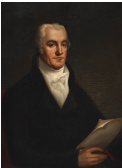
Joel Barlow was a well-known literary figure and consul to Algiers, 1795–97.